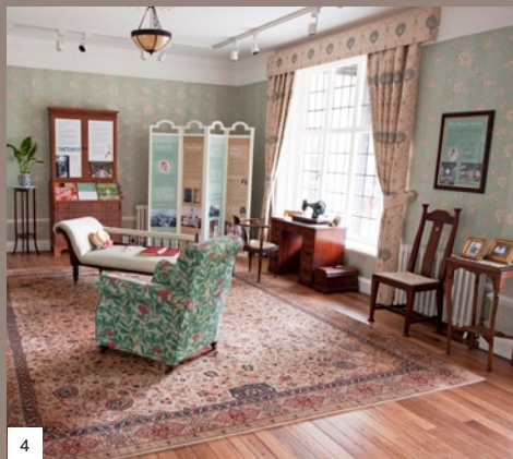
2. Winterbourne House & Gardens, Birmingham – Exhibition Design and Build